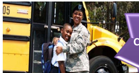
Military Child Identifier

Academic Credit for Prior Military Training